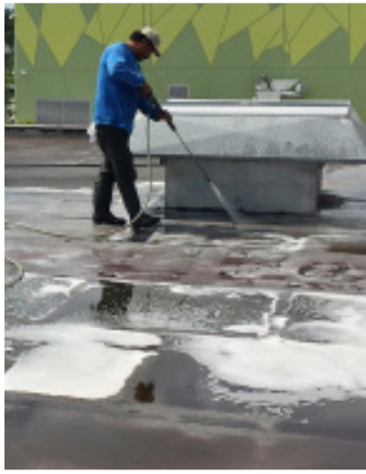
Using GacoWash Concentrated Cleaner to remove debris and oil.

keeps the production line moving during this flat roof restoration.