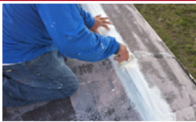
GacoFlex E5320 2-Part Epoxy Primer/Filler and GacoFlex SF2000 SeamSeal applied before GacoFlex S20.