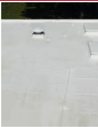
After the roof restoration was complete.

GacoFlex S20 Roof Coating System / Flat Roof Restoration, Hialeah, FL